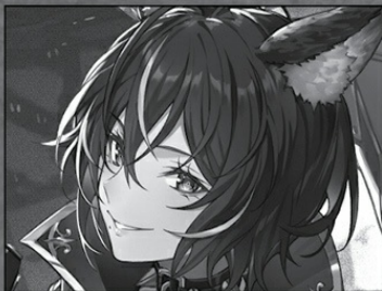
Eighth World: Malebolge the Chaotic

A beast with an abyssal depth of 13, the strongest in history. Seeks to annihilate the entire human race.