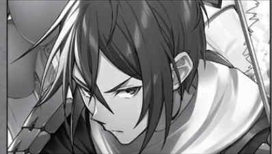
Koga Tsukishima (Swordsman)

The descendant of a legendary assassin. Has an exceptional aptitude for combat.