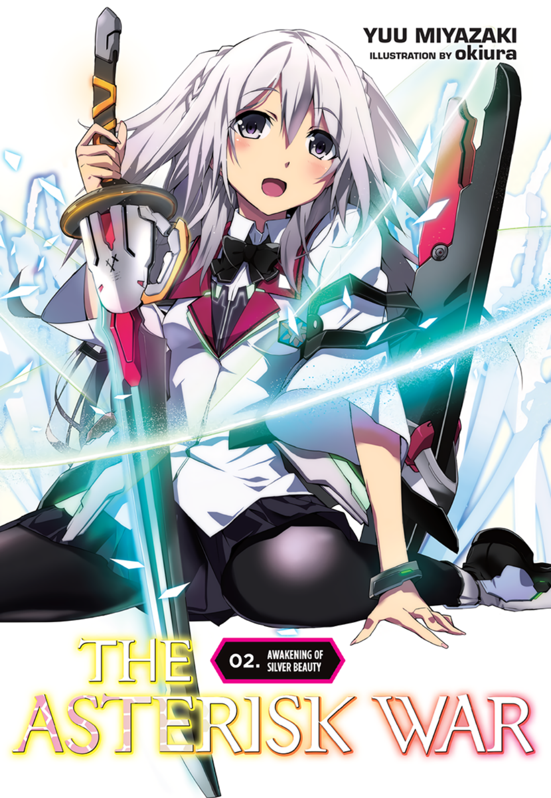
ILLUSTRATION BY okiura