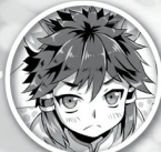
Arslan Werelion Boy