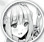
Dryas High Class Spirit of the Spirit Folk Village