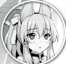
Latifa Werewolf Girl & Former Slave. Reincarnated from another world and fondly calls Rio "Onii-chan."