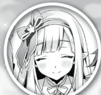
Orphia High Elf Girl