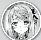
Flora Beltrum Second Princess of the Kingdom of Beltrum