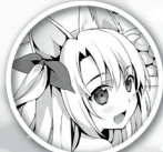
Vera Silver Werewolf Girl & Sara's Sister