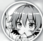
Alma Elder Dwarf Girl