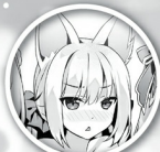
Sara Silver Werewolf Girl