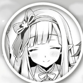
Orphia High Elf Girl