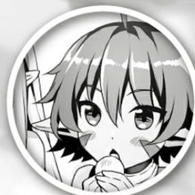
Alma Elder Dwarf Girl