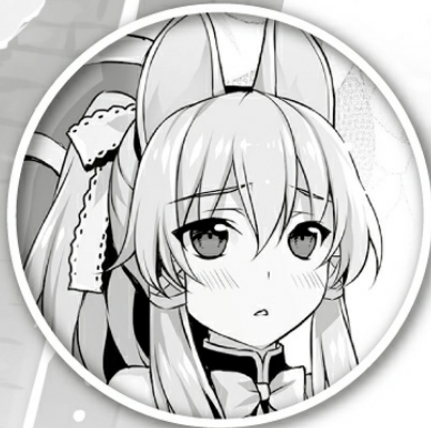
Latifa Werefox Girl & Former Slave. Reincarnated from another world and fondly calls Rio "Onii-chan."