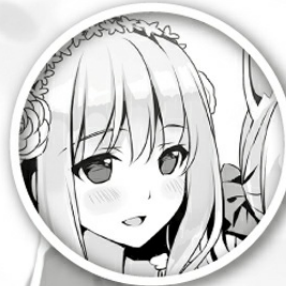
Dryas High Class Spirit of the Spirit Folk Village