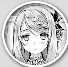
Flora Beltrum Second Princess of the Kingdom of Beltrum