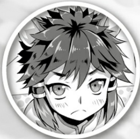
Arslan Werelion Boy