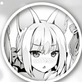
Sara Silver Werewolf Girl