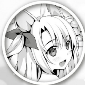
Vera Silver Werewolf Girl & Sara's Sister