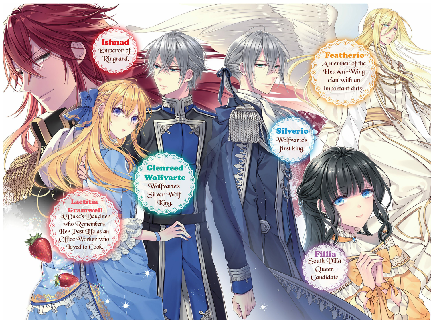
Ishnad Emperor of Ringrard.