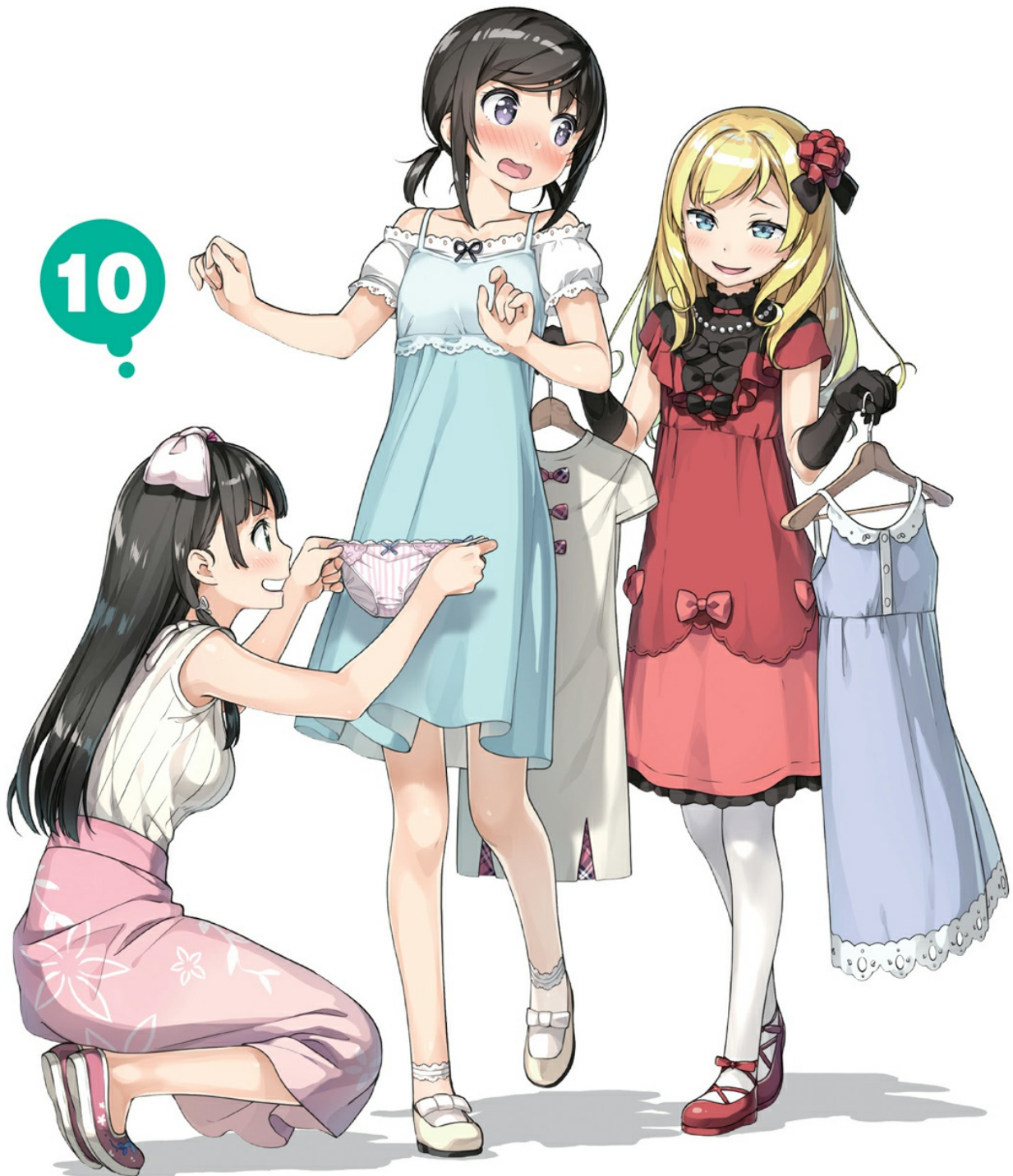
Illustration by Kantoku