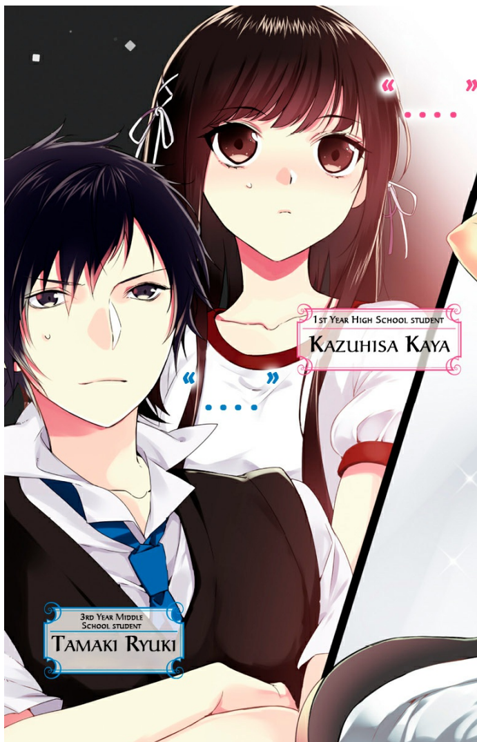
3RD YEAR MIDDLE SCHOOL STUDENT TAMAKI RYUKI