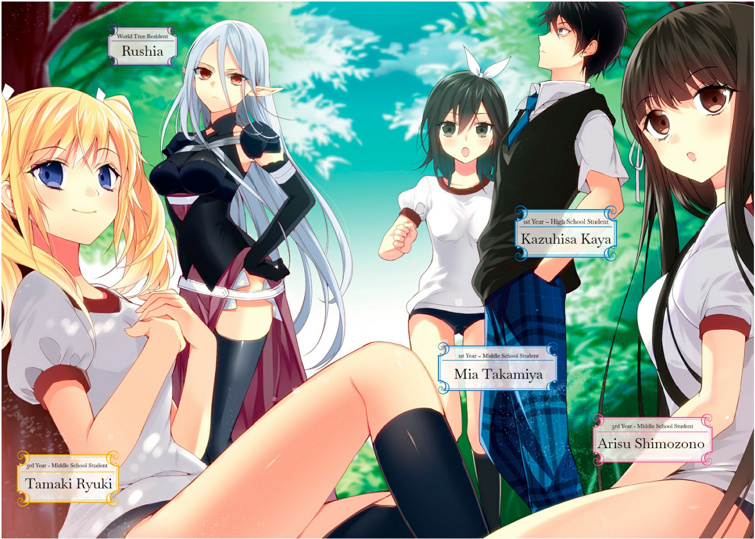
World Tree Resident Rushia