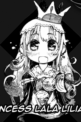
PRINCESS LALA LILIA

Lord Designs' daughter. Though possessing doll-like beauty, she lost all of her emotions when her father offered her soul to the Devil.