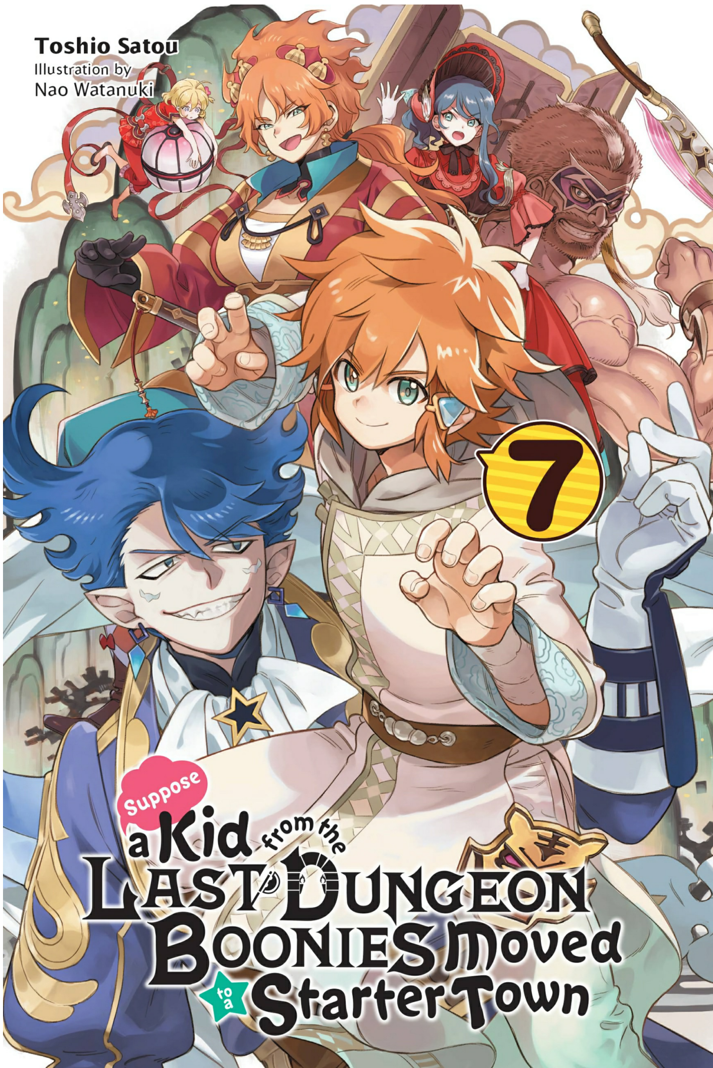
Illustration by Nao Watanuki