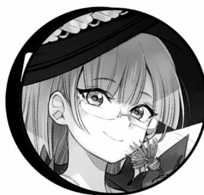
Marie the Witch

Boy raised in the town of legend. Even stronger after training with the demon lord!