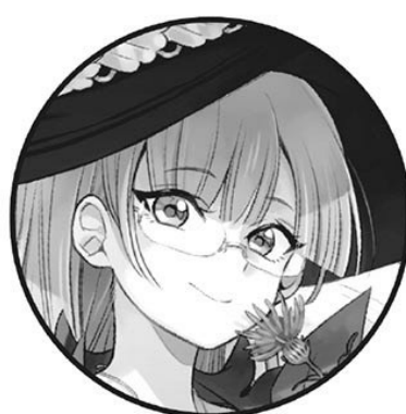
Marie the Witch

Boy raised in the town of legend. Worried about his career path.