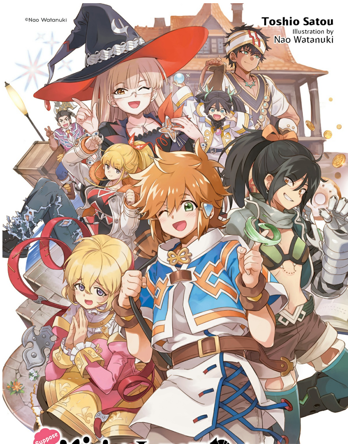
Illustration by Nao Watanuki