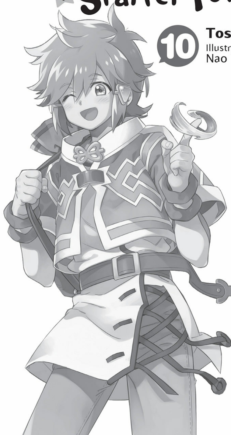
Illustration by Nao Watanuki