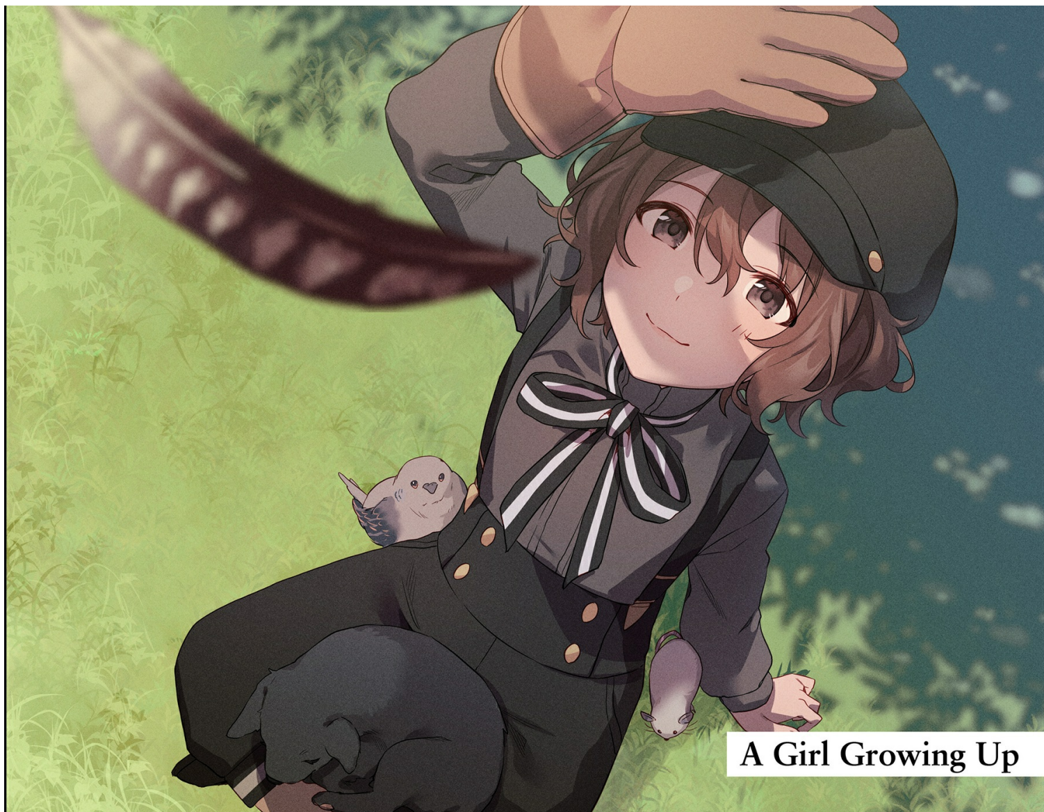
A Girl Growing Up