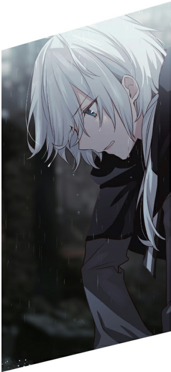
code name GLINT