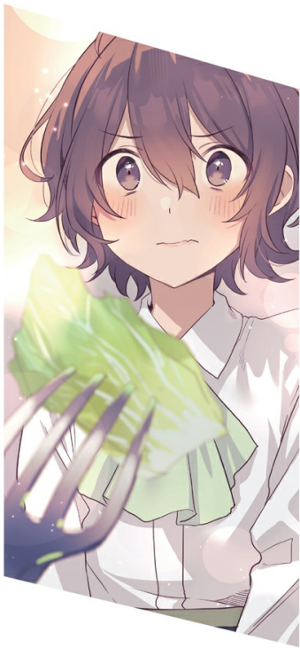
code name MEADOW