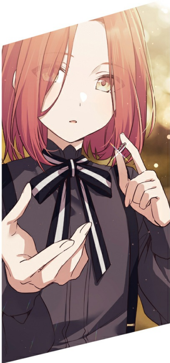
code name DAUGHTER DEAREST