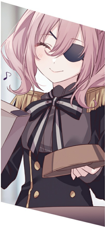
code name FORGETTER