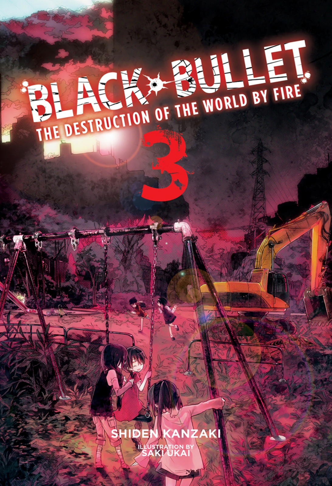
ILLUSTRATION BY SAKI UKAI