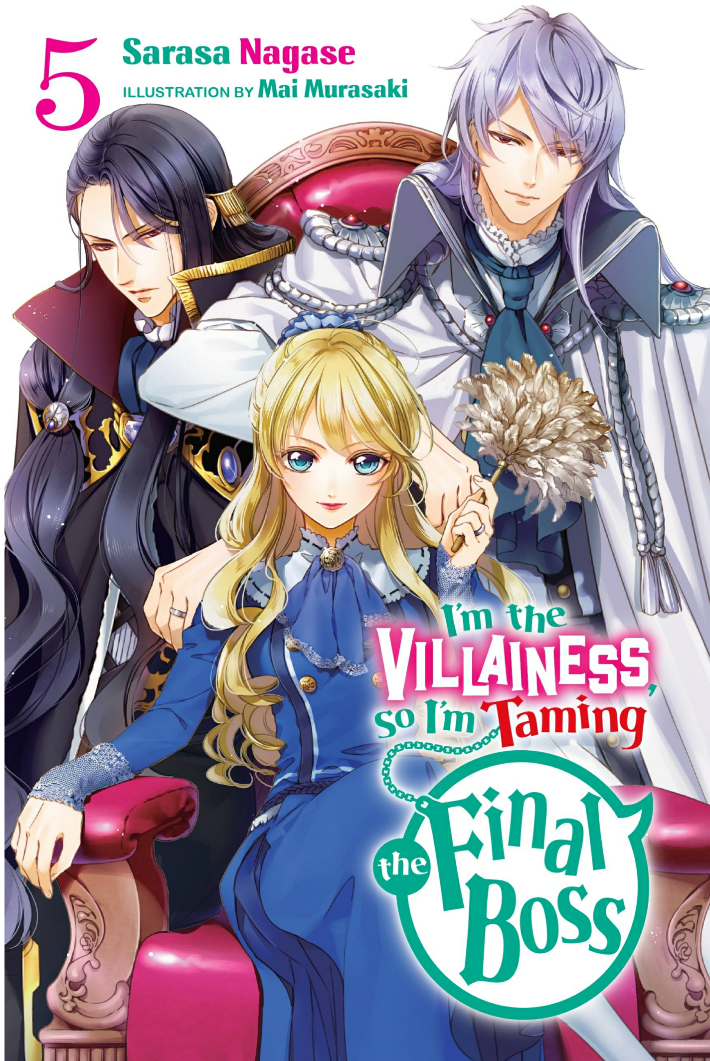
ILLUSTRATION BY Mai Murasaki