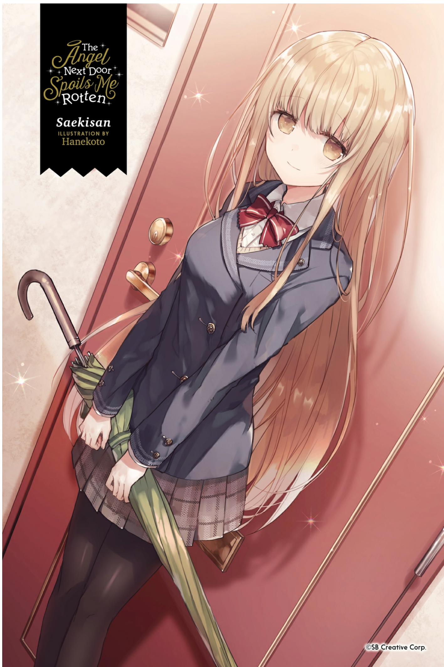
ILLUSTRATION BY Hanekoto