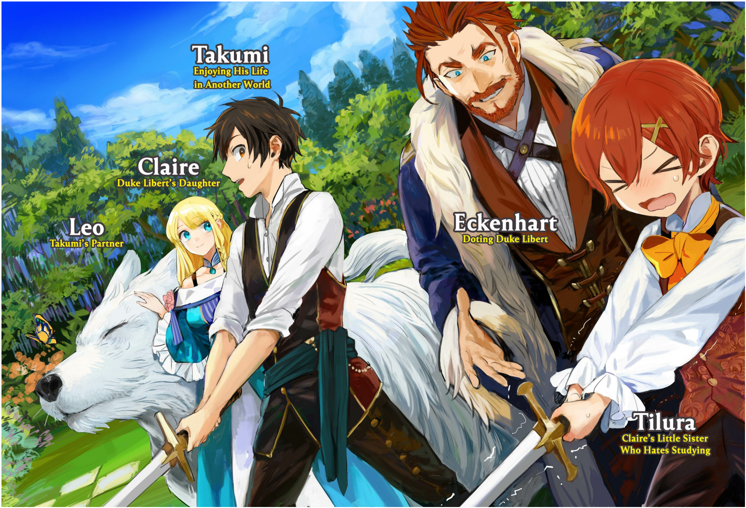
Takumi Enjoying His Life in Another World