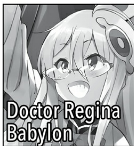
Doctor Regina Babylon

Terminal Gynoid in charge of the Alchemy Lab, one of the Babylon relics. She's called Flora for short and wears a nurse outfit. Her Airframe Serial Number is #21. A nurse with dangerously big boobs and even more dangerous medicines.