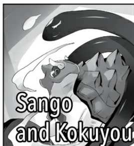
Sango and Kokuyou

The third of Touya's summoned Heavenly Beasts. She is the Flame Monarch, ruler of feathered things. Though her appearance is flashy and extravagant, she's actually quite cool and collected.