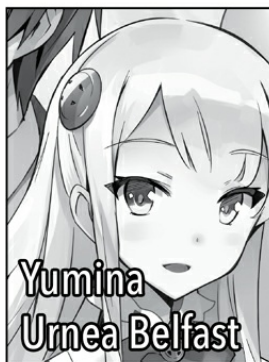
Yumina Urnea Belfast

One of Touya's fiancées. The elder of the twin sisters saved by Touya some time ago. A ferocious melee fighter, she makes use of gauntlets in combat. Her personality is fairly to-the-point and blunt. She can make use of Null fortification magic, specifically the spell [Boost] . She loves spicy foods.