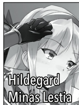
Hildegard Minas Lestia

One of Touya's fiancées. Former Clan Matriarch of the Fairies, she now serves as Brunhild's Court Magician. She claims to be six-hundred-and-twelve years old, but looks tremendously young. She can wield every magical element except Darkness, meaning her magical proficiency is that of a genius. Leen is a bit of a light-hearted bully.