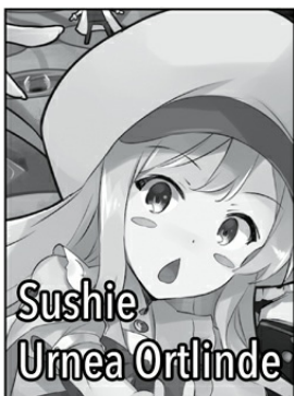
Sushie Urnea Ortlinde

A highschooler who was accidentally murdered by God. He's a no-hassle kind of guy who likes to go with the flow. He's not very good at reading the atmosphere, and typically makes rash decisions that bite him in the ass. His mana pool is limitless, he can flawlessly make use of every magical element, and he can cast any Null spell that he wants. He's currently the Grand Duke of Brunhild.