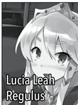
Lucia Leah Regulus

One of Touya's fiancées. She was ten years old in her initial appearance. Her nickname is Sue. The niece of Belfast's king, and Yumina's cousin. Touya saved her from being attacked on the road. She has an innocently adventurous spirit.