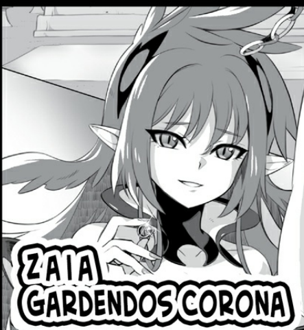
ZAIA GARDENDOS CORONA

A former hero and Demon King of another world. She left her domain to a regent and is currently staying at Rosalind's mansion.