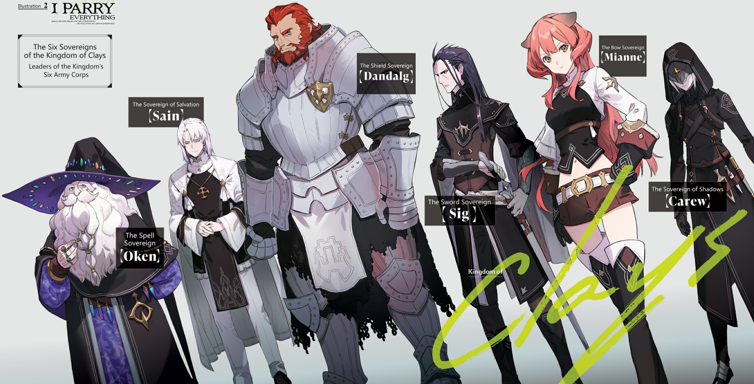
The Sovereign of Salvation [Sain]

The Six Sovereigns of the Kingdom of Clays Leaders of the Kingdom's Six Army Corps