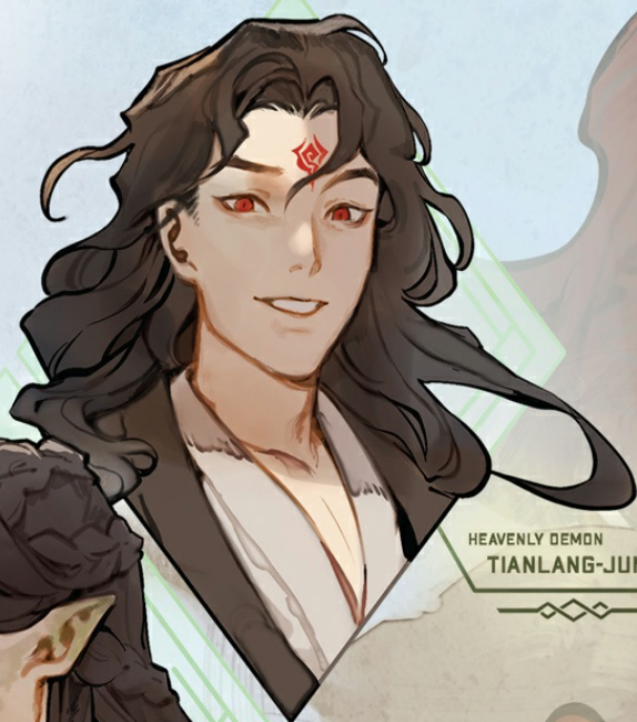
HEAVENLY DEMON TIANLANG-JUN

Luo Binghe has finally made his desire for his old master clear. For all that Shen Qingqiu longs to return to their peaceful days together on Qing Jing Peak, he knows it's impossible now that Luo Binghe has darkened into a true demon lord. But as Shen Qingqiu begins to uncover more of Proud Immortal Demon Way 's hidden plot, including his host body's own backstory, he realizes he must learn to see Luo Binghe for who he truly is if either of them are to survive.