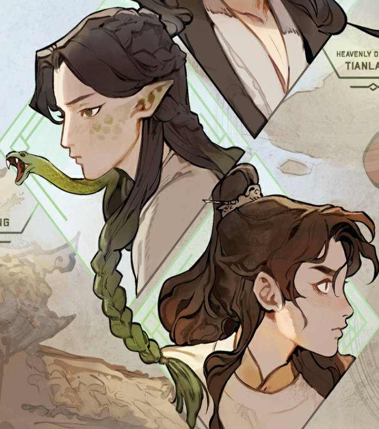
DEMON GENERAL ZHUZH-LANG