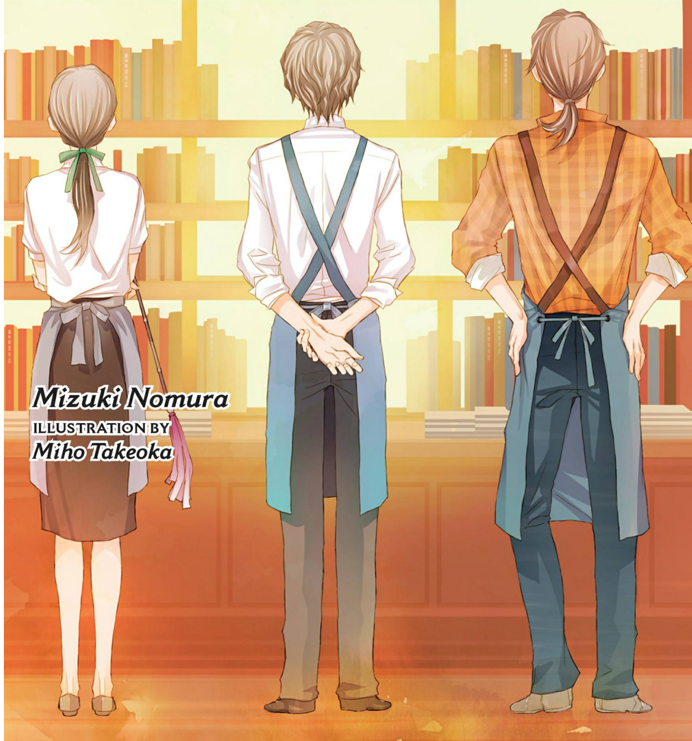
ILLUSTRATION BY Miho Takeoka