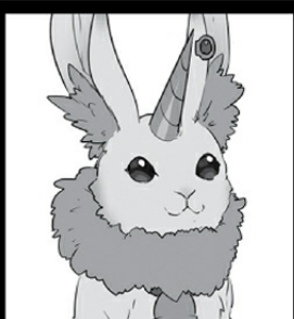
Sybe (Unicorn Rabbit Form)