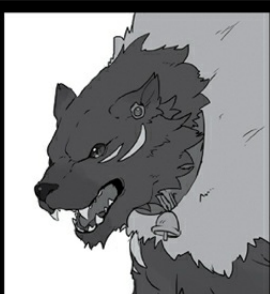
Sybe (Psychobear Form)

Head of the Dark Army's Silent Listeners