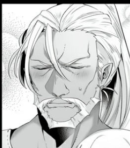
Sleip (Human Form)