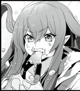
Wyne (Human Form)

Flio and Rys's son. Caught the eye of the Maiden Queen.