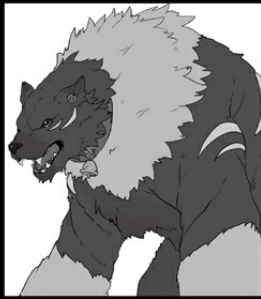
Sybe (Psychobear Form)

Freeloader with high stats and a big appetite.