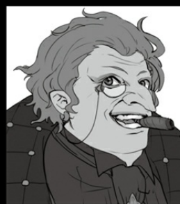
The Shadow King

A foul-mouthed devil who loves her little sister.