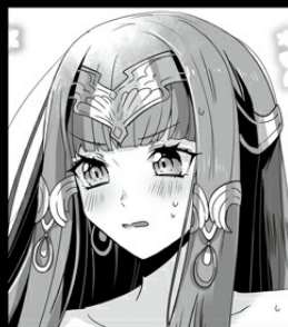
Ellie (The Maiden Queen)

The former King of Klyrode, and head of the Shadow Conglomerate.