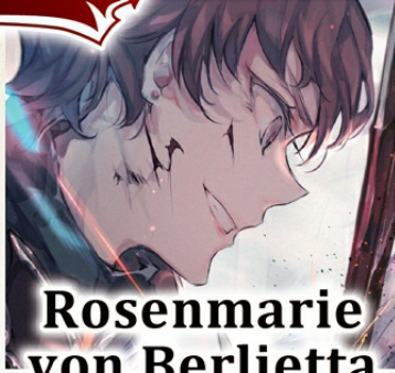
Rosenmarie von Berlietta

One of the empire's Three Generals. He commands the Azure Knights. Descendent of the Asura, the enemy of the Deep Folk.