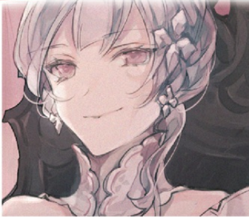
Sofitia Hell Mekia

Seventh in the line of Seraphs, she rules Mekia with irresistible charisma.