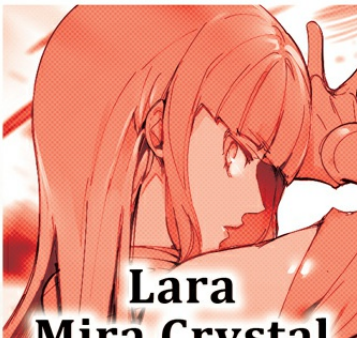
Lara Mira Crystal

Seventh in the line of Seraphs, she rules Mekia with irresistible charisma.