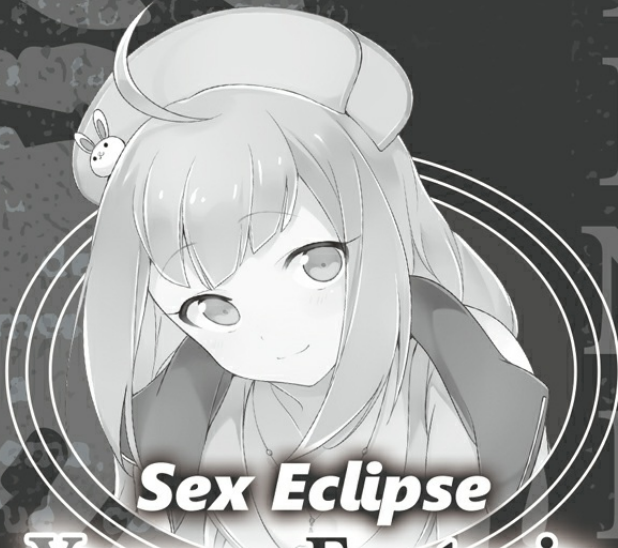
Sex Eclipse Yusano Fantasia