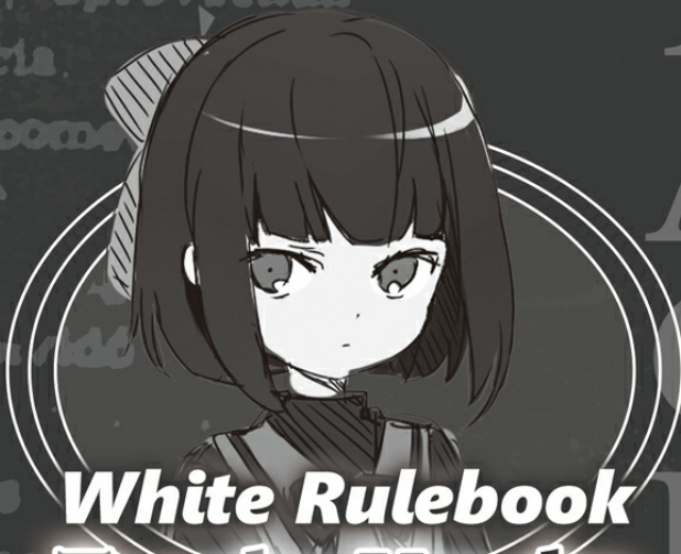
White Rulebook Tanaka Umeko