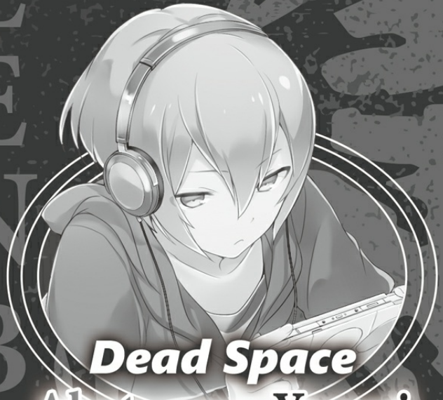
Dead Space Akutagawa Yanagi