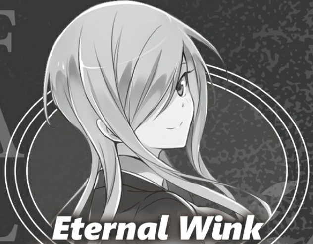
Eternal Wink Saitou Hitomi