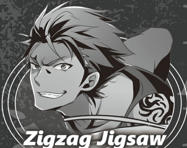
Zigzag Jigsaw Toki Shuugo