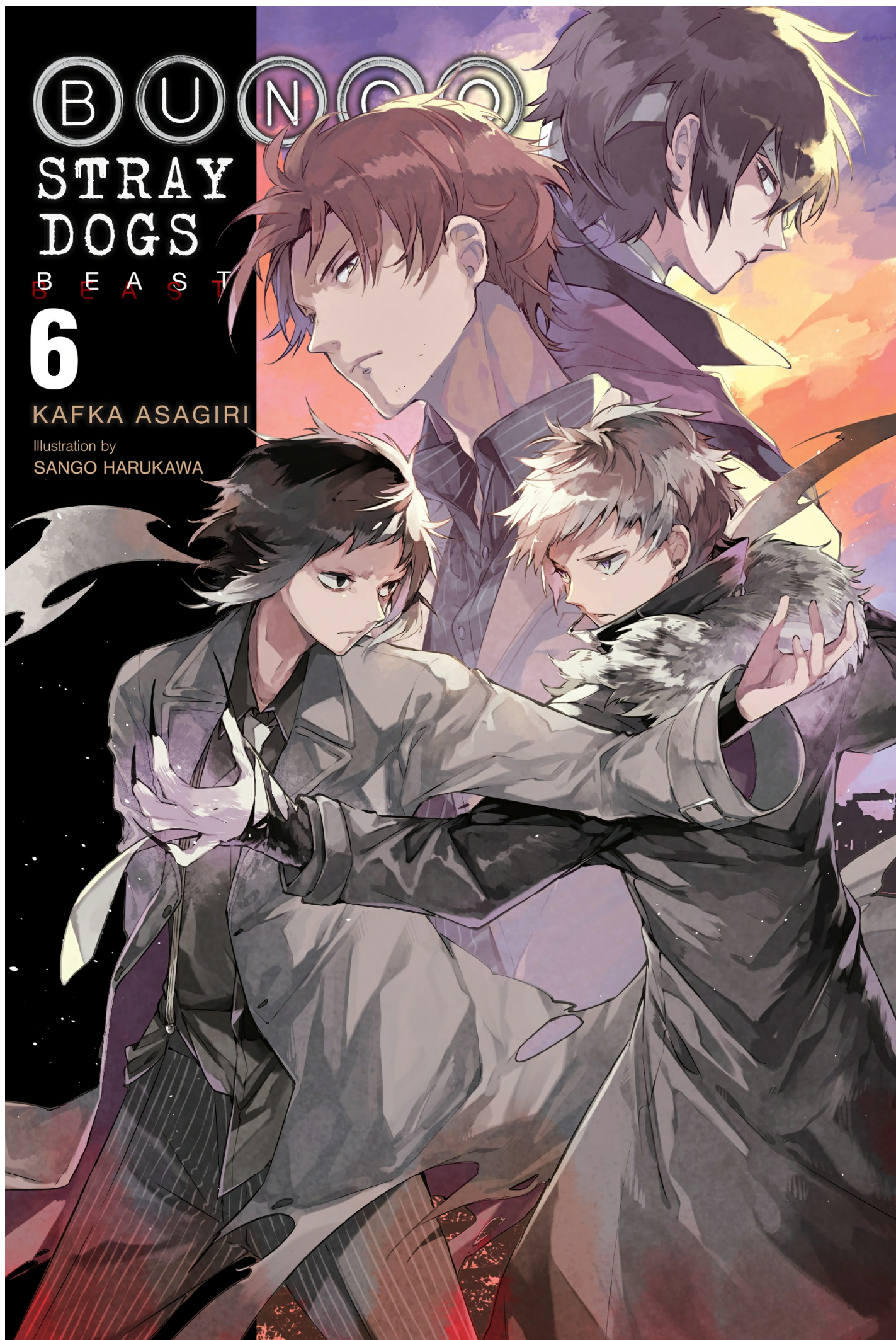
Illustration by SANGO HARUKAWA