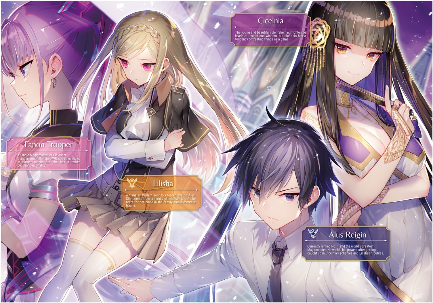
Cicelnia The young and beautiful ruler. She has frightening levels of insight and wisdom, but she also has a tendency of treating things as a game.