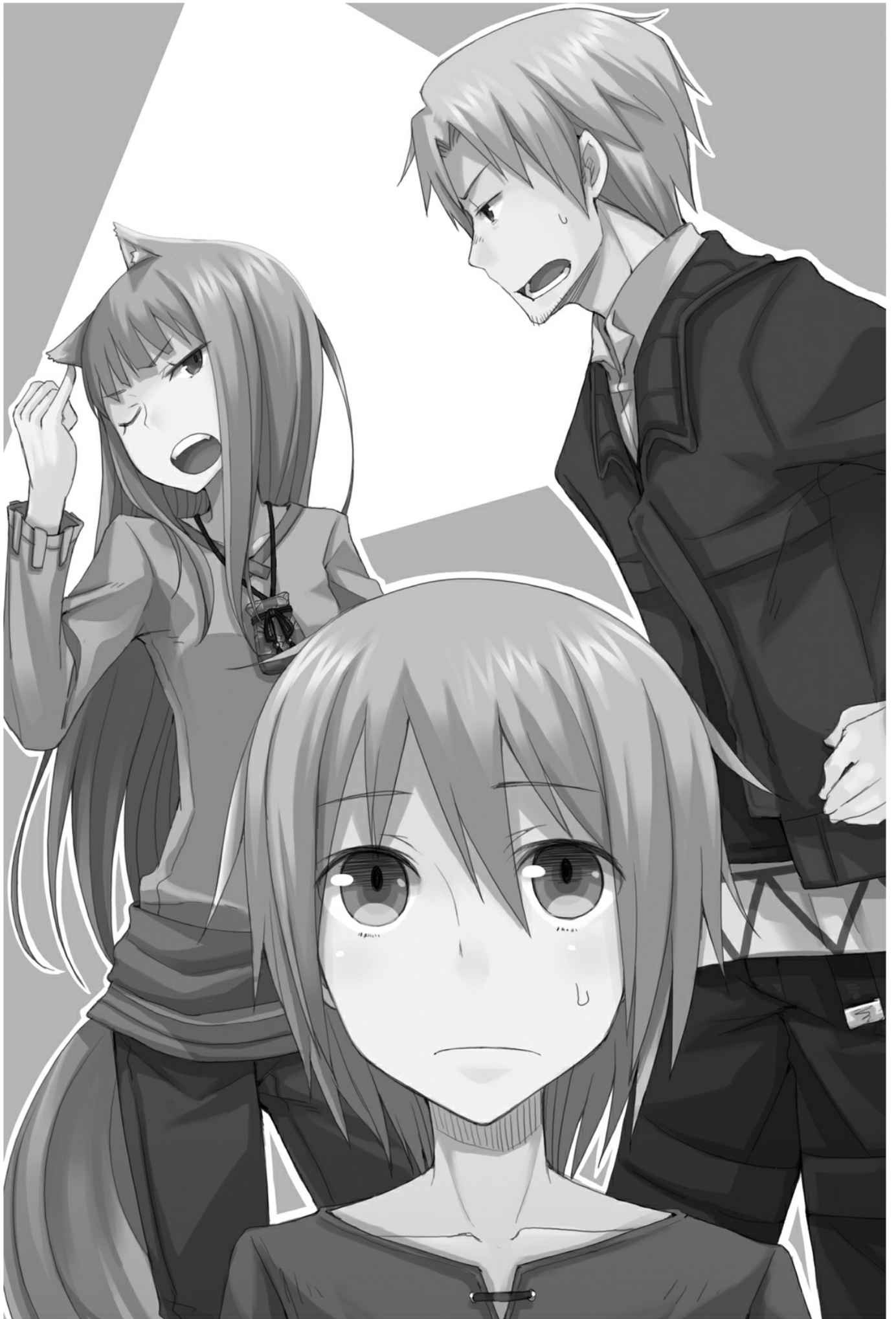
GRAY SMILING FACE AND WOLF