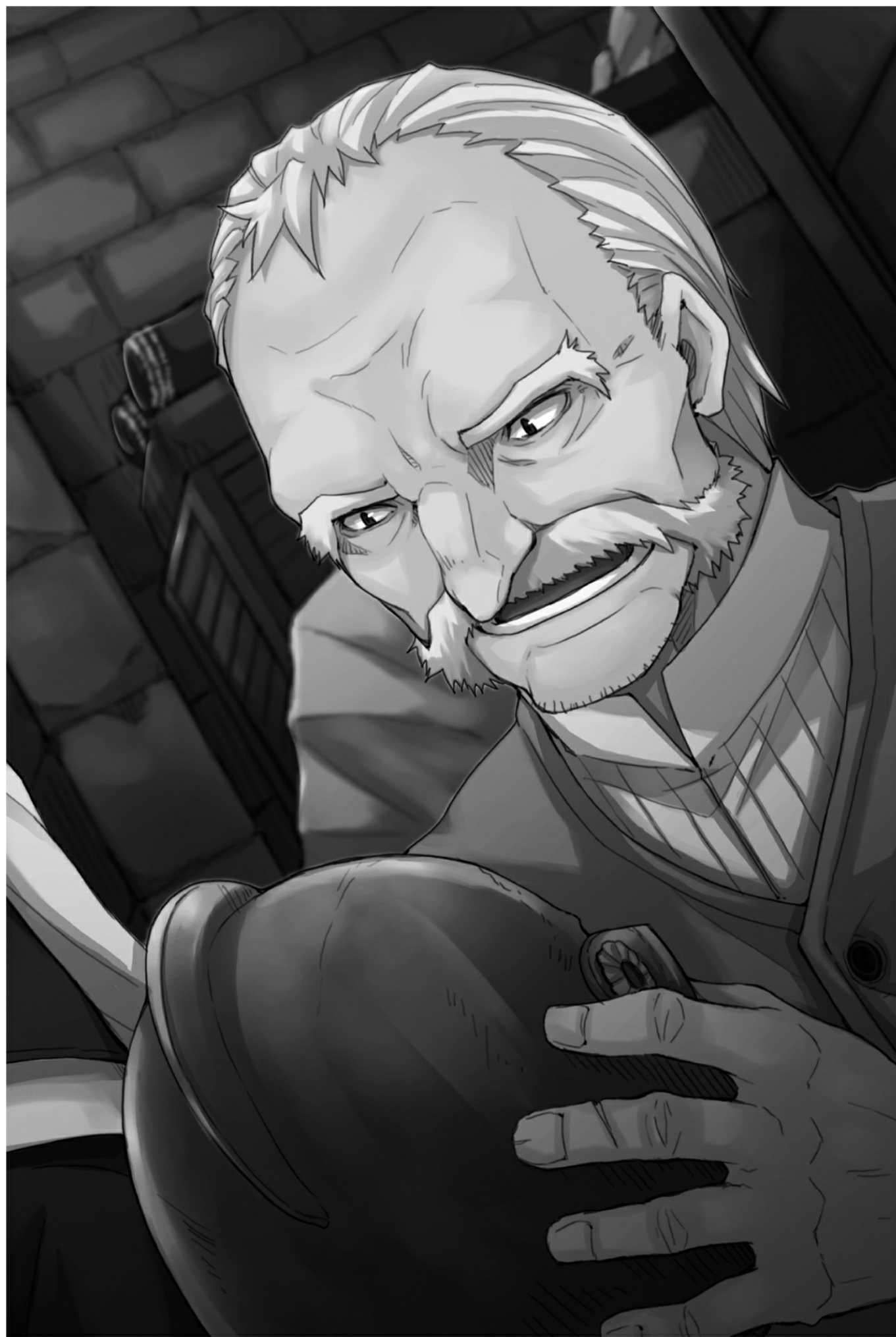
TRAVELING MERCHANT AND GRAY KNIGHT