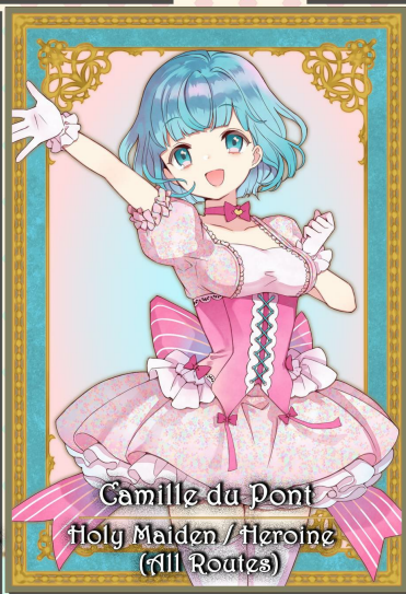
Camille du Pont Holy Maiden / Heroine (All Routes)