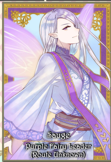
Sauge Purple Fairy Leader (Route Unknown)