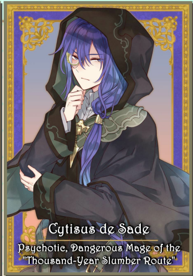
Cytisus de Sade Psychotic, Dangerous Mage of the "Thousand-Year Slumber Route"