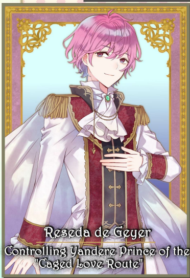
Reseda de Geyer Controlling Yandere Prince of the "Caged Love Route"