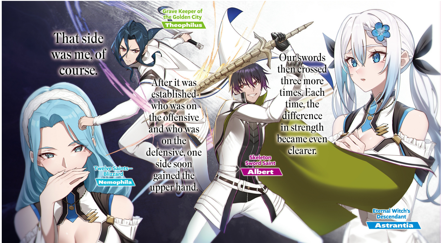
Grave Keeper of the Golden City Theophilus