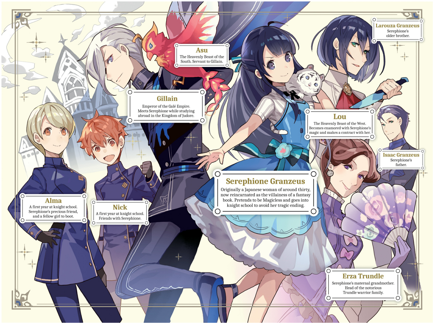
Larouza Granzeus Serephione's older brother.