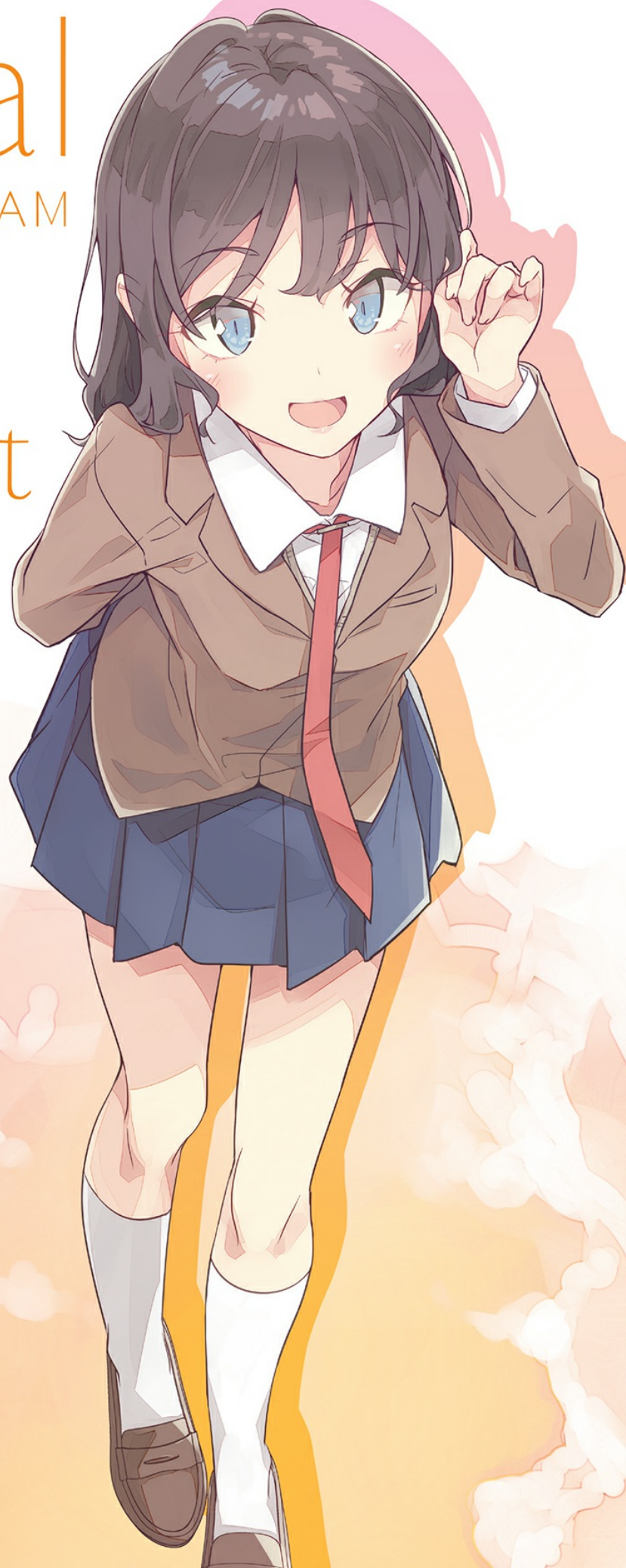
Illustration by KEJI MIZOGUCHI