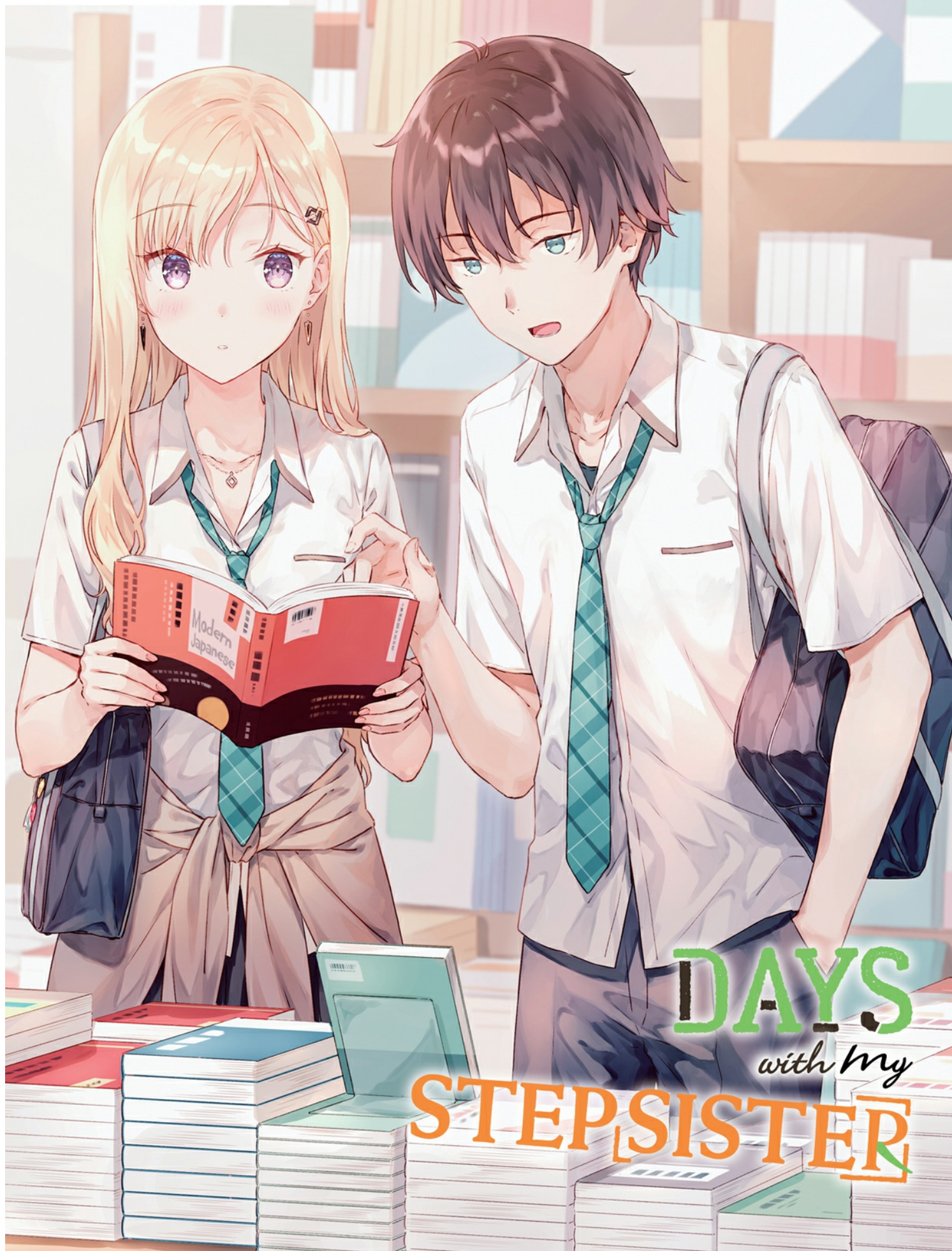
Illustration by Hiten