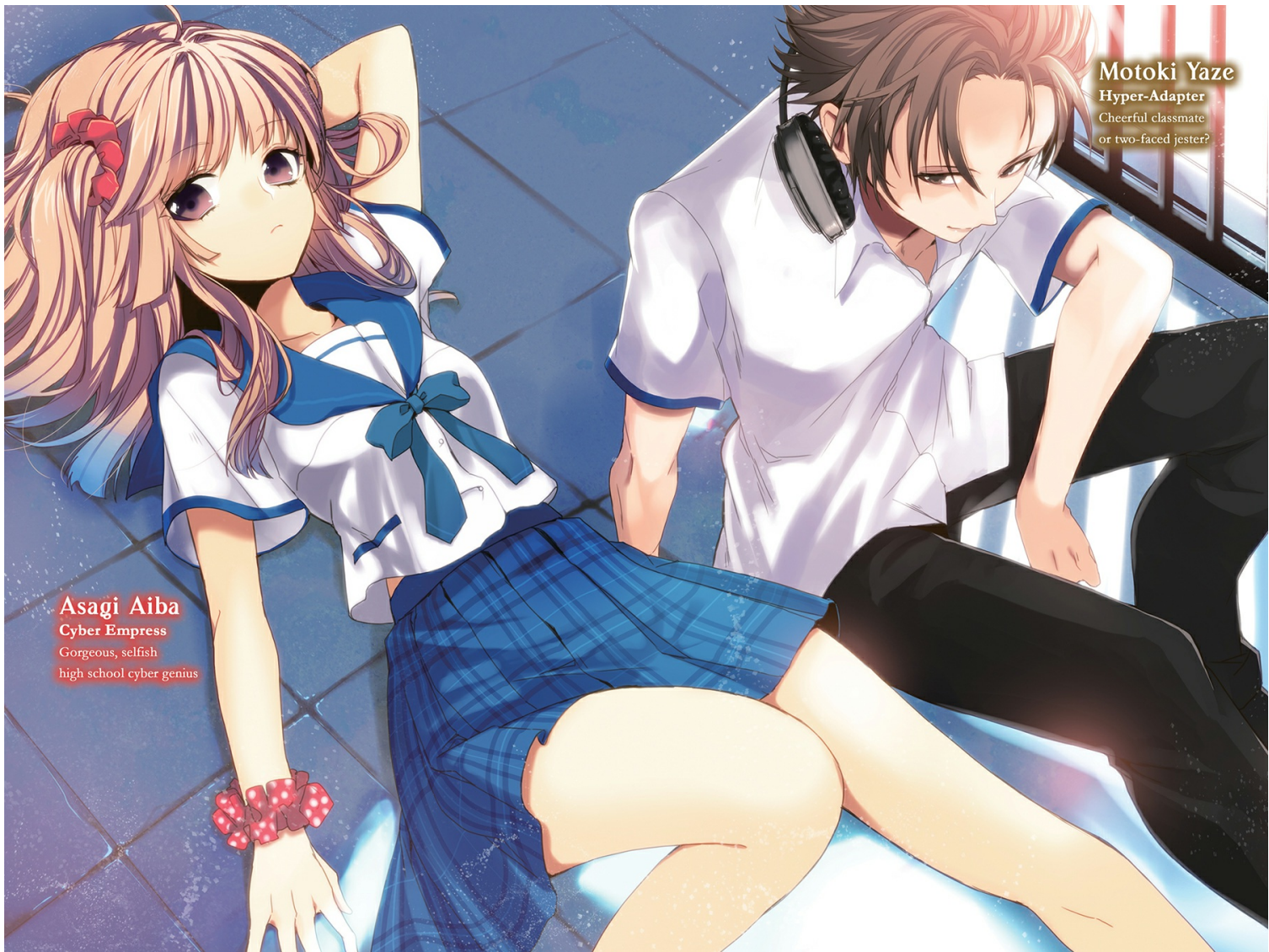
Asagi Aiba Cyber Empress Gorgeous, selfish high school cyber genius