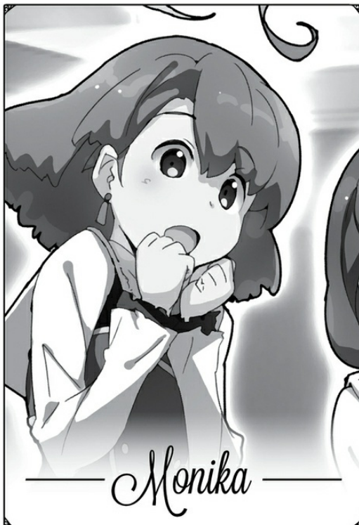
— Monika —

The king's third daughter. Intrigued by Adele.