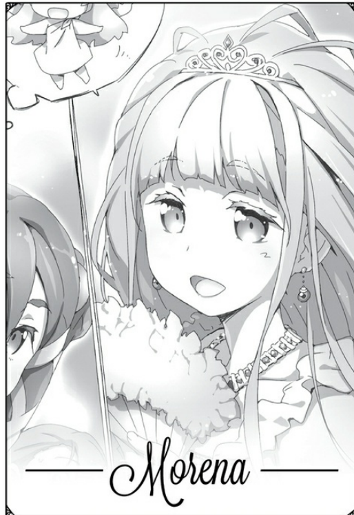
— Morena —

The king's third daughter. Intrigued by Adele.