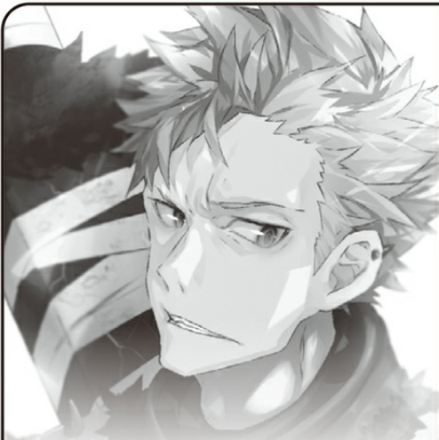
Head of Team Renji. Wild beast-type. Dangerous.