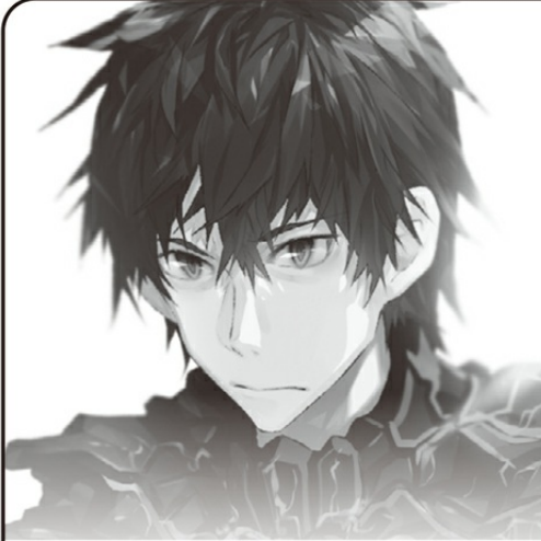
Started the Day Breakers Clan. Seems to have some objective.