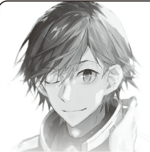
Kept the party together. Was a good guy. (Past tense)