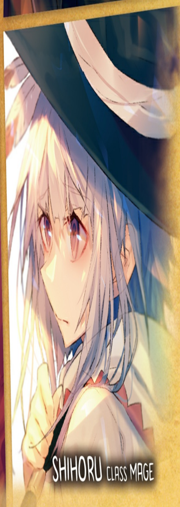
SHIHORU CLASS MAGE