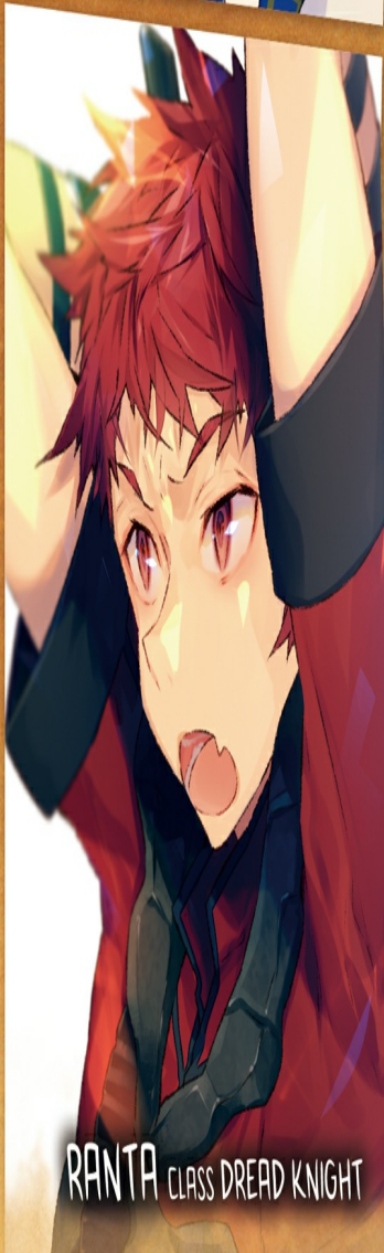
RANTA CLASS DREAD KNIGHT