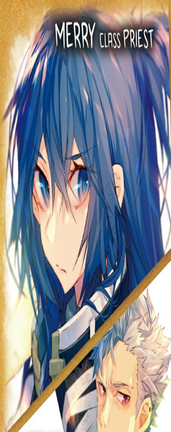
MERRY CLASS PRIEST