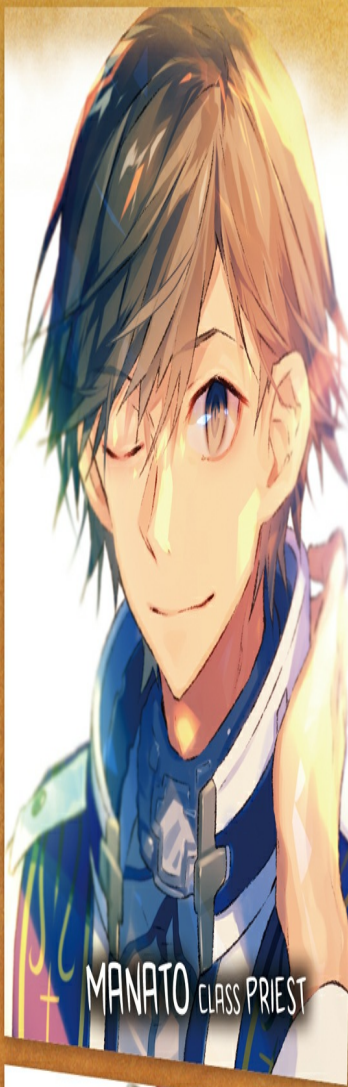
MANATO CLASS PRIEST