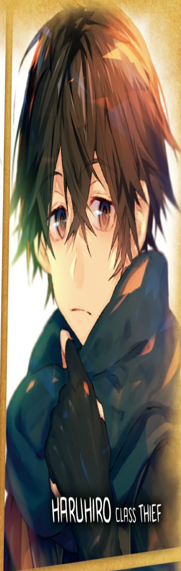
HARUHIRO CLASS THIEF