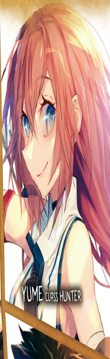
YUME CLASS HUNTER