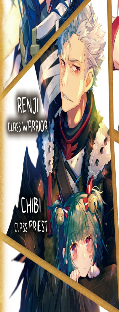
CHIBI CLASS PRIEST