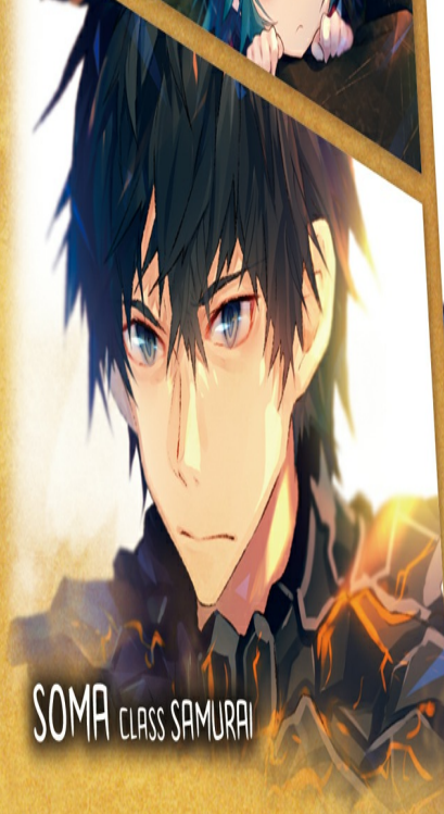
SOMA CLASS SAMURAI